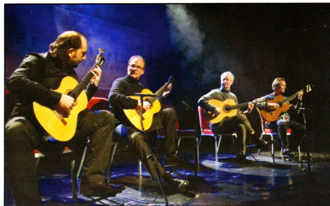
Eos Guitar Quartet perform in the Casino Theatre, Winterthur 2013.

Switzerland does not often feature in GG. The majority of festival reports from around the world tend to centre on elsewhere in Europe and America. This situation isn't for the lack of Swiss-guitar; indeed Switzerland has a great deal to offer in this regard, not least its