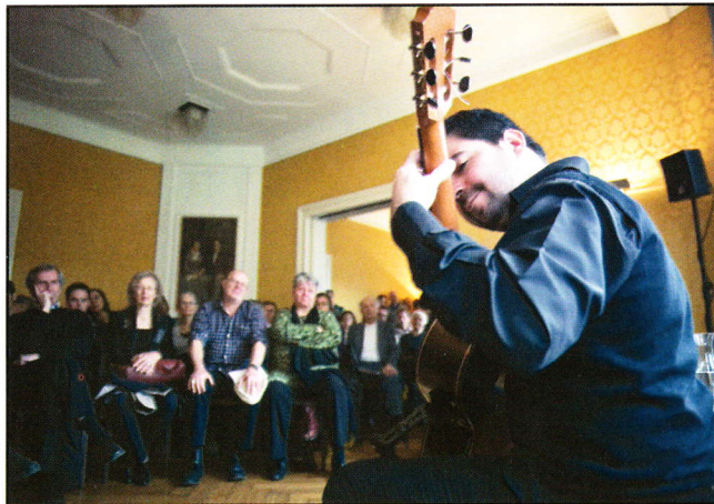
Solo performance in one of Winterthur's historic homes.