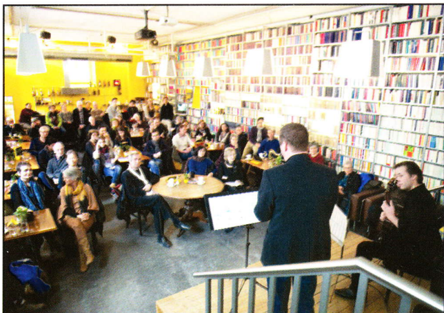
Jazz Cafe morning recital.

Although I have alluded so far to a sort of underground Swiss guitar scene, it is in Winterthur that we find how guitar is supported and promoted in this country. Now in its third year, the event remains small. The rate of growth